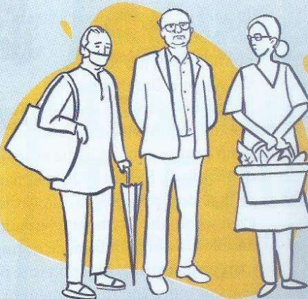
Senior Citizens (60-80 Years)