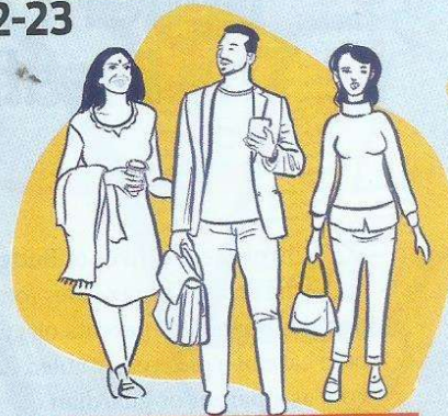
Individuals Under 60 Years