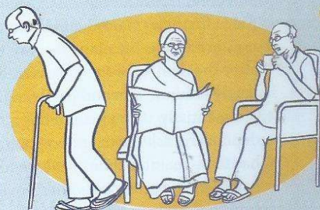
Very Senior Citizens (Above 80 Years)